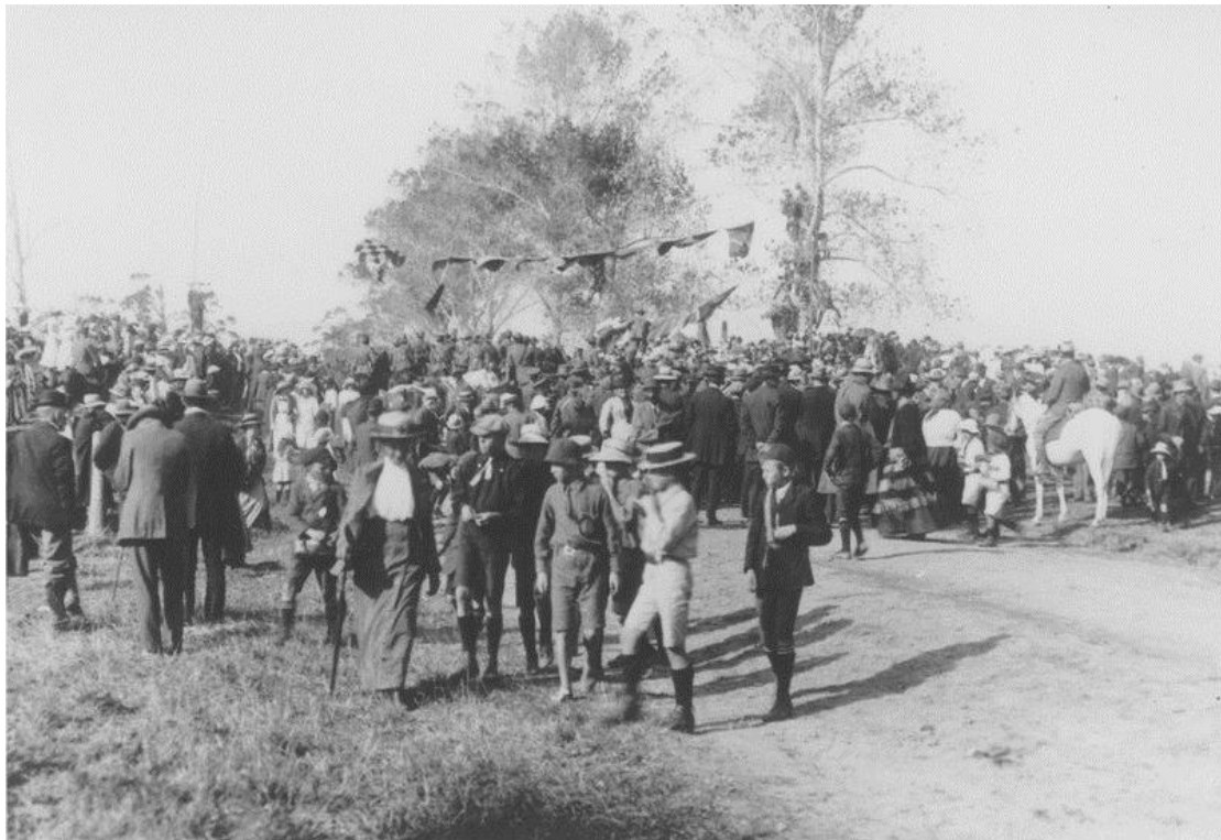
Fig. 1 “Orakau Memorial Unveiling,” 1914, PH282, Te Awamutu Museum